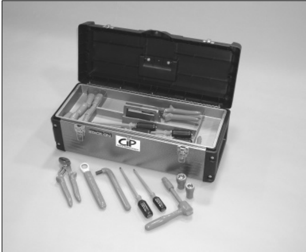
Figure 4. Hand tools electrically rated for 1000Vac can significantly reduce the likelihood of starting an electrical arc if accidentally dropped into equipment.

compromise their ability to protect the rubber insulating glove underneath.