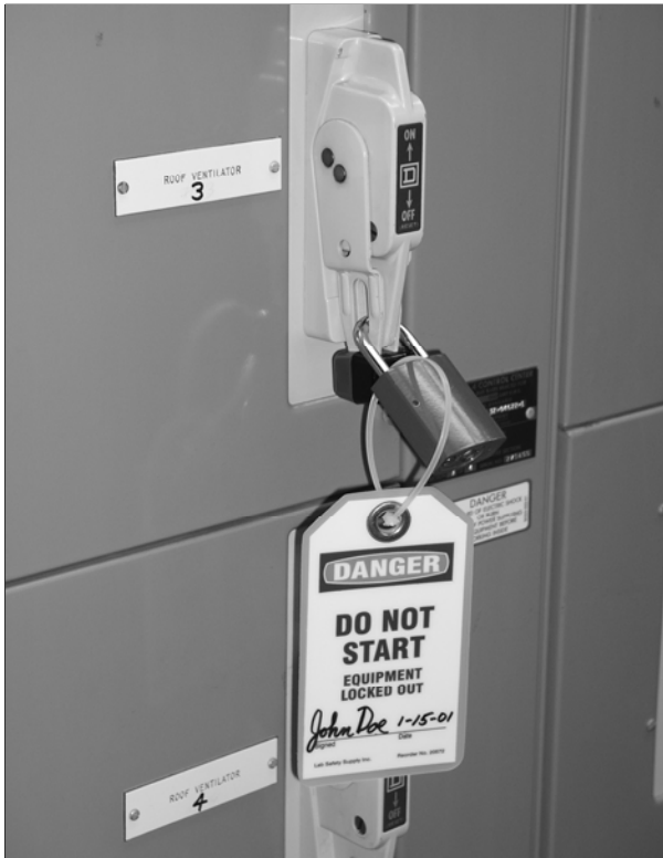
Figure 2. A properly applied lock and tag. Note that the tag cannot be easily removed, contains the name of the person who applied it, and the date of the work.

70E devotes considerable attention to proper LOTO procedures. A “complex” LOTO procedure involves systems or workplaces where multiple energy sources feed equipment, multiple crews, locations, or employers are working on the system at the same time, different or unusual disconnecting means are required in a specific sequence, or the job will continue for more than one shift. A complex LOTO requires one qualified person to be in charge of the LOTO procedure and only that person will install or remove locks and tags.