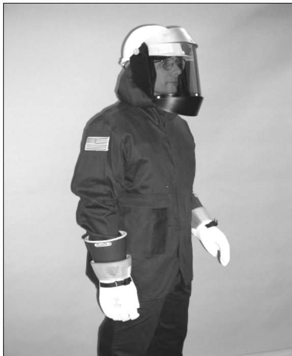
Figure 3. This worker is dressed for Hazard/Risk Category 2. He is wearing a hooded jacket and bib-overalls over FR work clothes, a combination face shield/hardhat over safety glasses, and voltage-rated gloves with leather protectors.

In addition, always wear ANSI-rated safety glasses or goggles under a face shield.