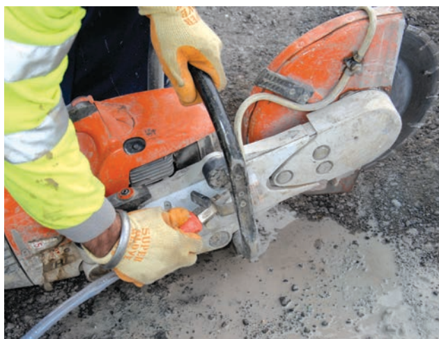
Figure 3 Water suppression on a cut-off saw