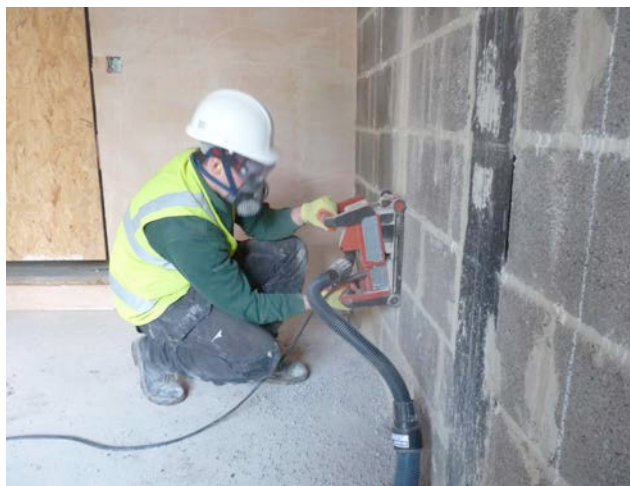
Figure 4 Wall chasing using on-tool extraction