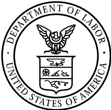
U.S. Department of Labor