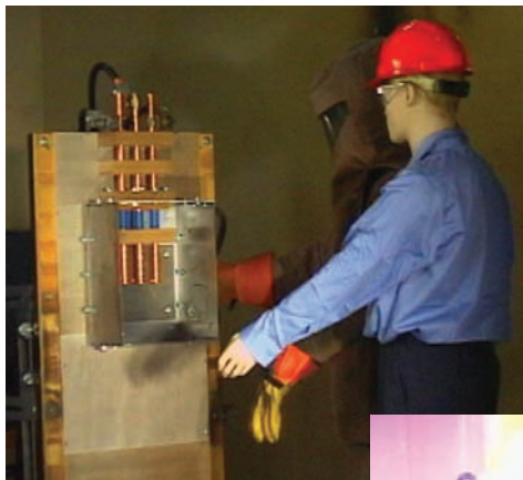
Worker nearing an open electrical panel