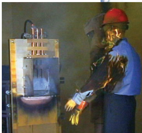
Non-FR work clothing burns after arc exposure