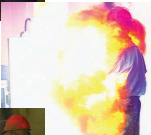
Bright, intense flash from the arc engulfs the worker