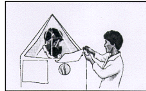
Qualitative Fit Test Chamber

A: Yes, employees using tight-fitting facepiece respirators are required to perform a user seal check each time they put on the respirator. They must use the procedures in Appendix B-1 of 29 CFR 1910.134 or procedures recommended by the respirator manufacturer that the employer demonstrates are as effective as OSHA's procedures. Note that a fit test is a method used to select the right size respirator for the user. A user seal check is a method to verify that the user has correctly put on the respirator and adjusted it to fit properly, as illustrated below.