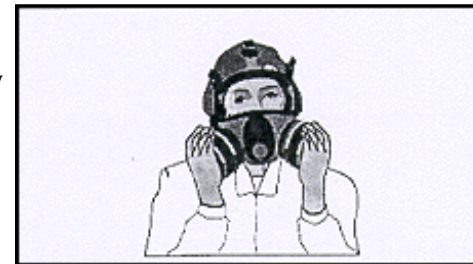
User Seal Check: worker covering inlet and inhaling (negative pressure check)