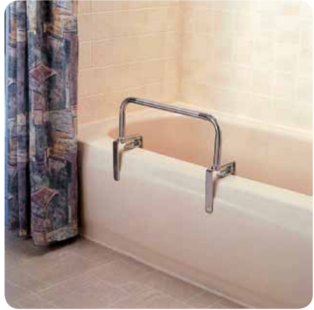
Figure 2.8. Grab bars