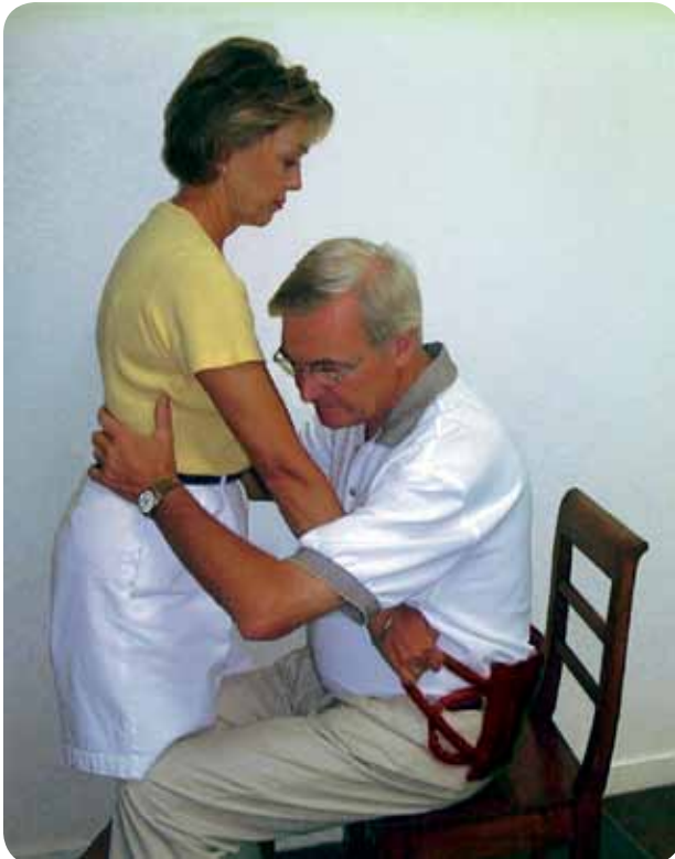
Figure 2.3. Patient moving sling