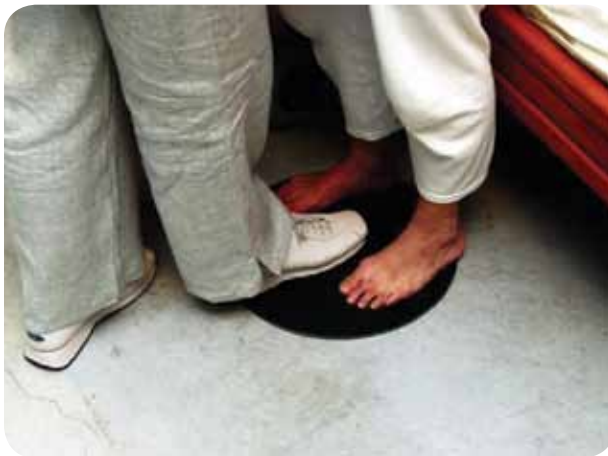
Figure 2.9. Rotation disk