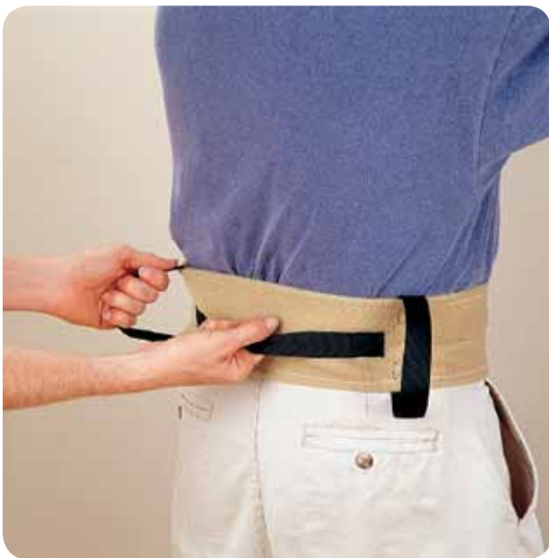
Figure 2.5. Gait/walking belt