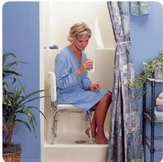
Figure 2.6. Stationary shower chair (Copyright by Sammons Preston Rolyan. Reprinted with permission.)