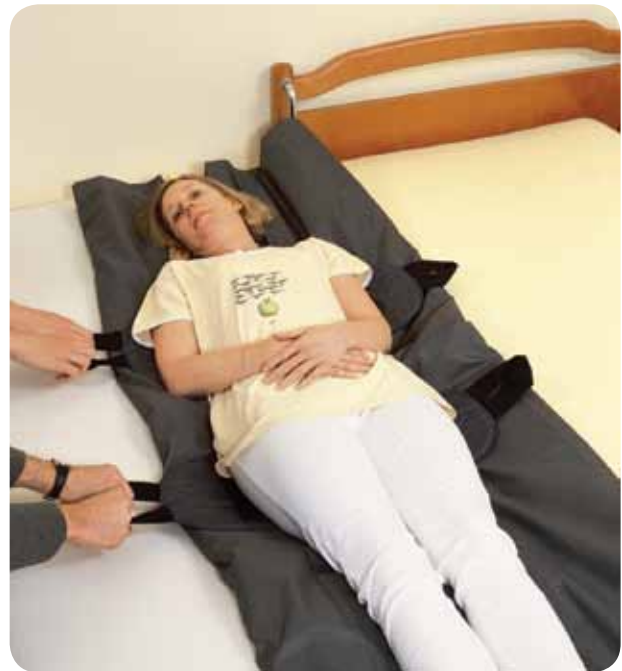
Figure 2.2. Slide/draw sheet (Copyright by SureHands Lift and Care Systems. Reprinted with permission.)