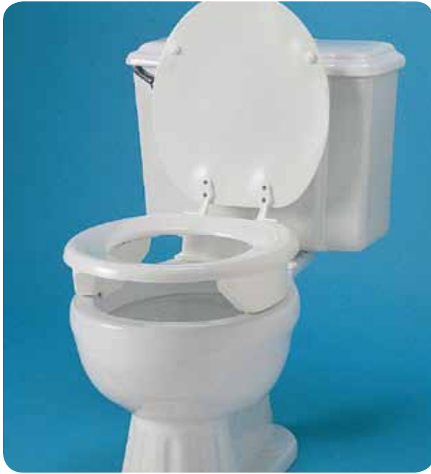
Figure 2.7. Raised toilet seat