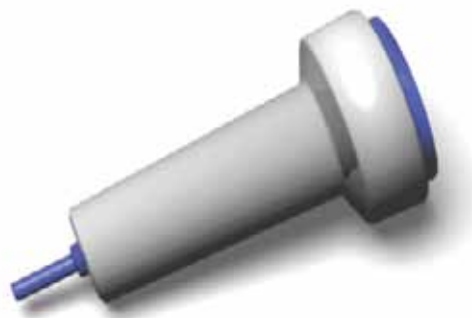
Figure 4.2. Example lancet with safety features. (This drawing is presented for educational purposes and does not imply endorsement of a particular product by the National Institute for Occupational Safety and Health [NIOSH].)