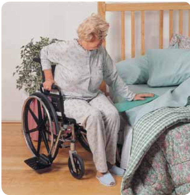
Figure 2.1. Slide/tranfer board