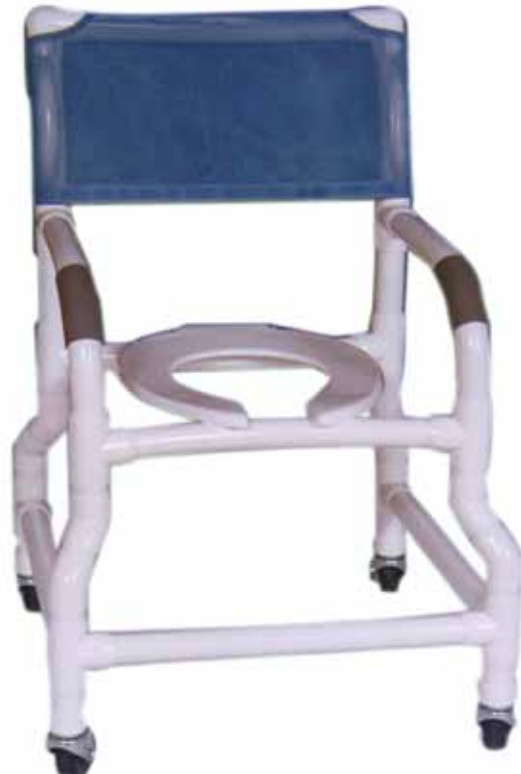
Figure 2.4. Rolling toilet/shower chair