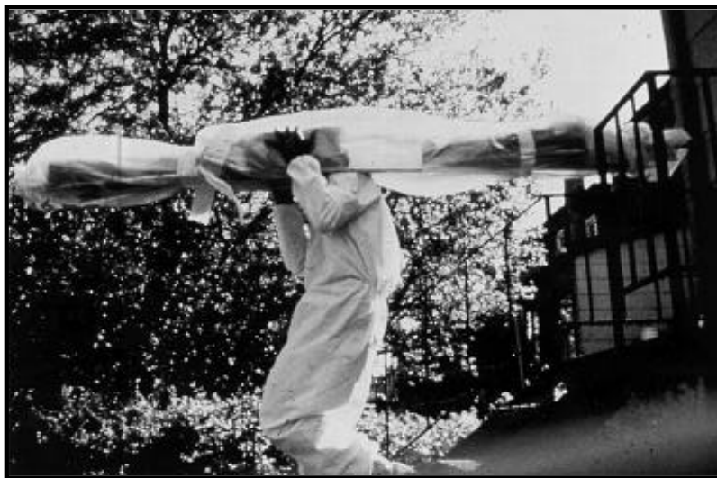
Figure 10.2 Seal Abatement Debris in Plastic Before Transporting Offsite.

EPA waste-study results for lead-based paint architectural components are inconclusive, and EPA is currently gathering additional data on