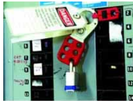
Lock-out tag-out saves lives.

Working on energized equipment should be the EXCEPTION not the RULE.